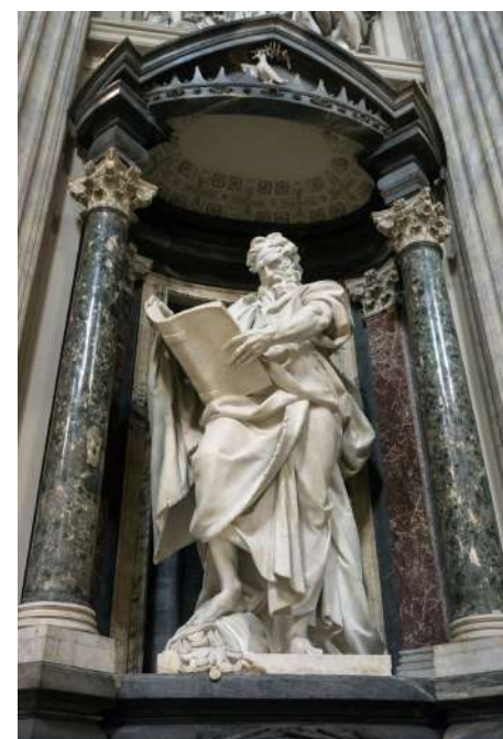
St. Matthew by Camillo Rusconi. Nave of the Basilica of St. John Lateran

The relic of St. Matthew the Apostle will be available for veneration before and after the Saturday 5pm Mass, and up to the Sunday 9:30am Mass. The Relic will be on the altar.