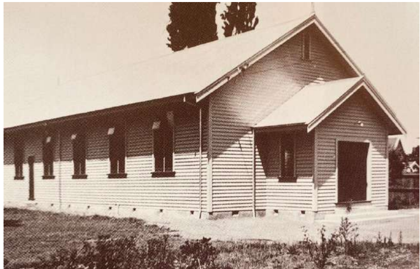
The Exterior of the first church - 1950 (now currently the parish hall)