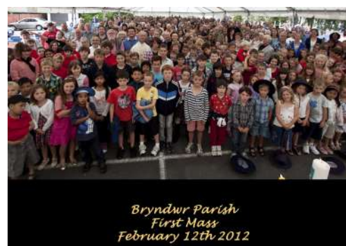
Bryndwr Parish First Mass February 12th 2012