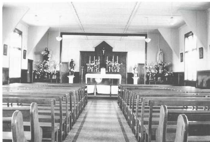
Interior of the first church (now the hall)