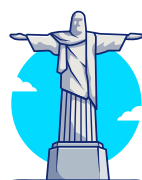
CHRIST THE REDEEMER

For those who are unable to be at Mass but want to vote, please send an email with your Vote of Patron to bulletin@christchurchnorth.org.nz