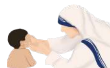
ST TERESA OF CALCUTTA